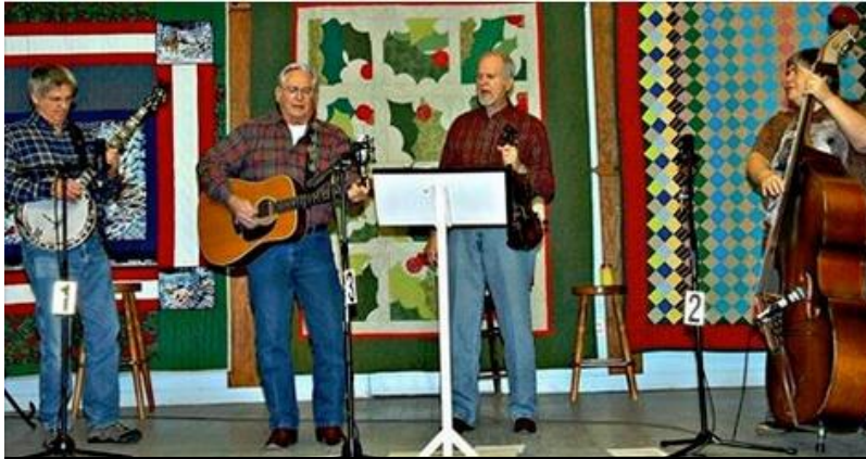
Blue Country Grass playing at the Sunday brunch at Threadgill's North, in Austin.

parts after being known as "Hillbilly" during the early years.