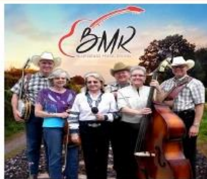
2. Almost Heaven Bluegrass Band;