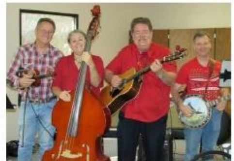
3. Cypress Ramblers