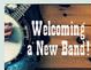
Lone Star Drive