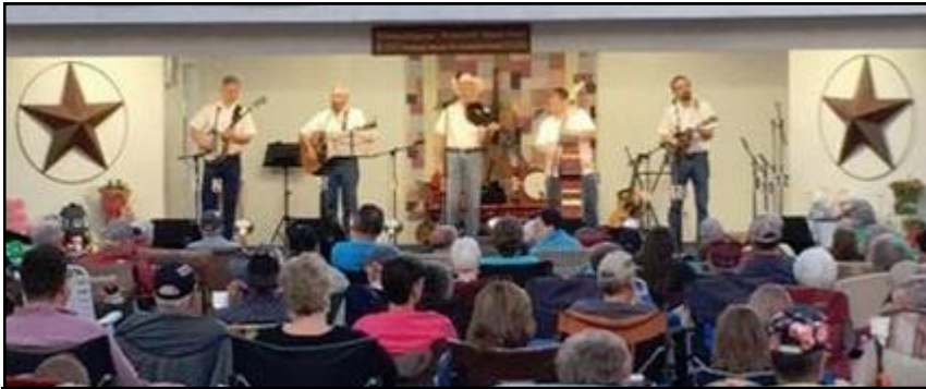
Blue Country Grass playing at Paluxy River Music Festival earlier this year.

make him and the music sound the best I can.